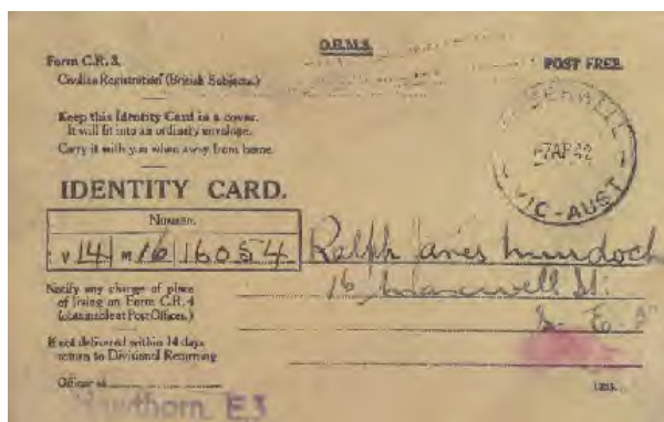
Fig. 2 Postal side of card