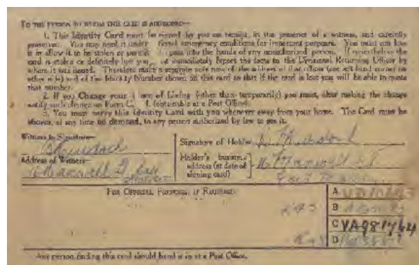
Fig. 3 Back of the identity Card